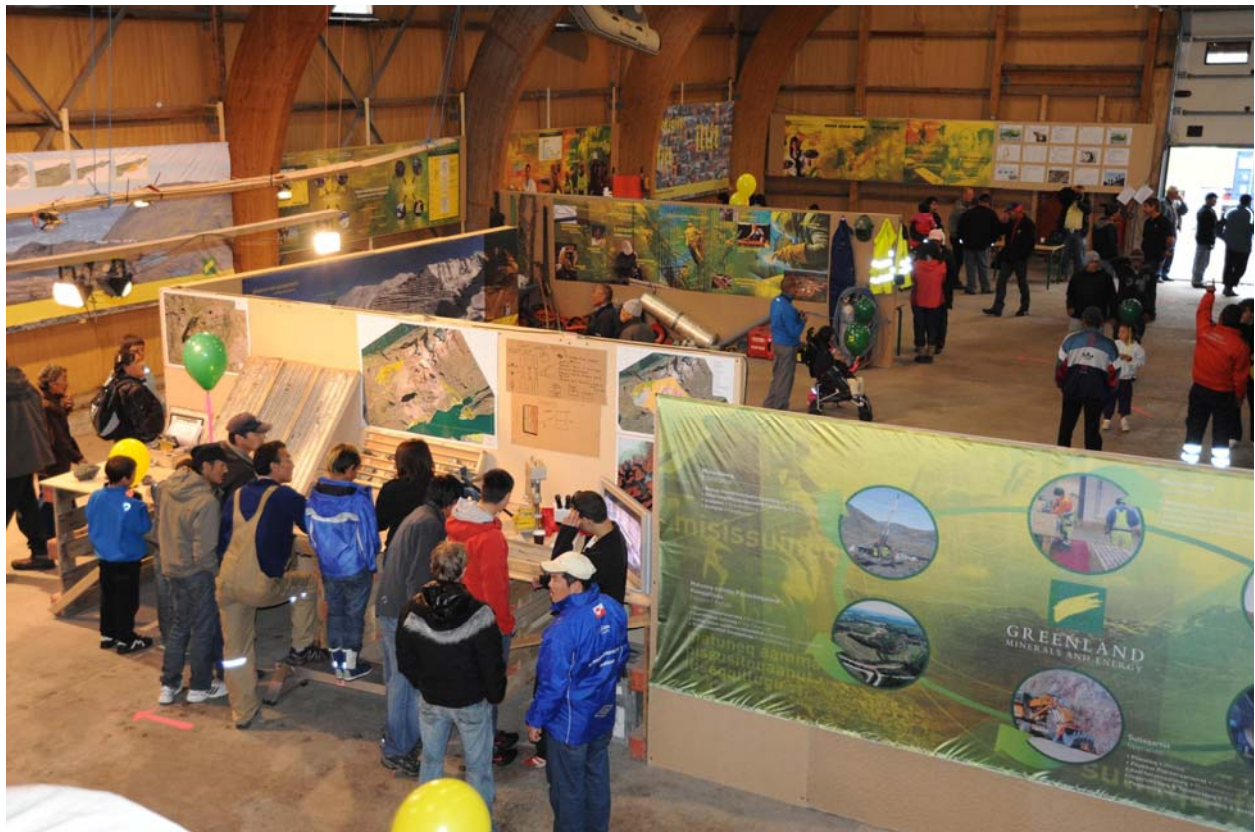
Figure 4. The GMEL operations base in Narsaq transformed into a display centre for the open day. Hundreds of south Greenland residents visited the open day to learn more about the Kvanefjeld project and the mining life cycle in general.

On August 8 th , GMEL held an open day at the company's operations base in Narsaq, south Greenland. The open day provided an opportunity for residents of Narsaq and nearby settlements to learn more about the work programs that are underway on the Kvanefjeld project, as well as learning about the mining life-cycle in general.