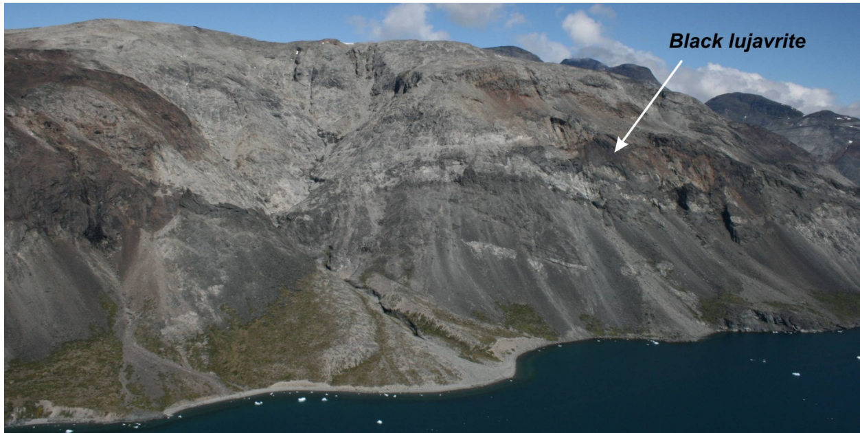
Figure 1. View over Tunugdliarfik fjord toward Zone 2. Thick layers of black lujavrite outcrop in the slopes, and are overlain by naujaite. The ridge top is approximately 700 m above sea level.

Exploration drilling was undertaken at Zone 2, located 6 km south of Kvanefjeld. Thirteen initial holes were completed for a total of 4710m, with several holes over 500m in length. This new multi-element prospect represents the Company's next focal point for resource development within the northern Ilimaussaq Complex. Initial results of the holes drilled at Zone 2 are expected late in 2010 to early 2011.