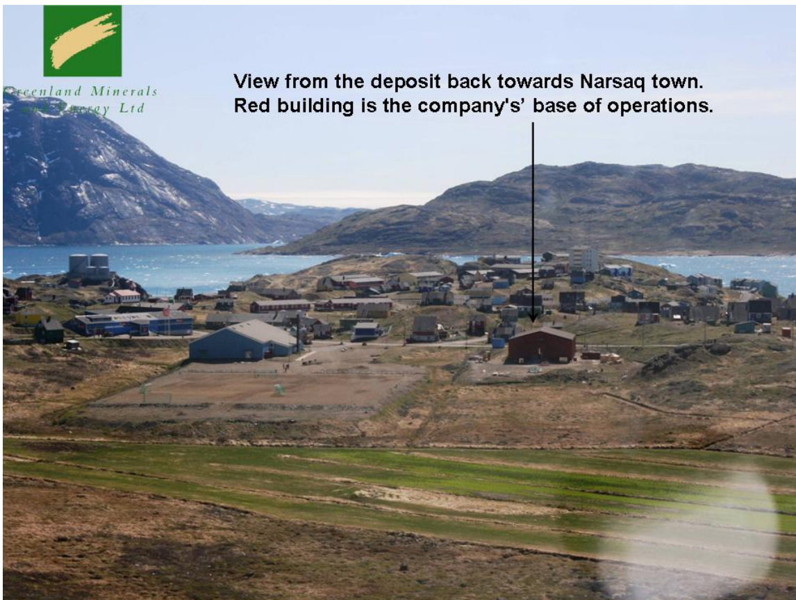
Figure 2, View from Kvanefjeld back towards the company's base of operations in Narsaq.